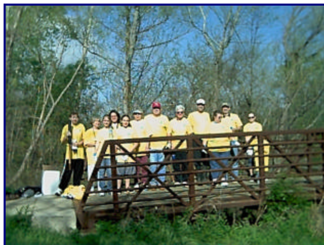
Figure 1: Volunteers at the Cravens Park litter challenge.