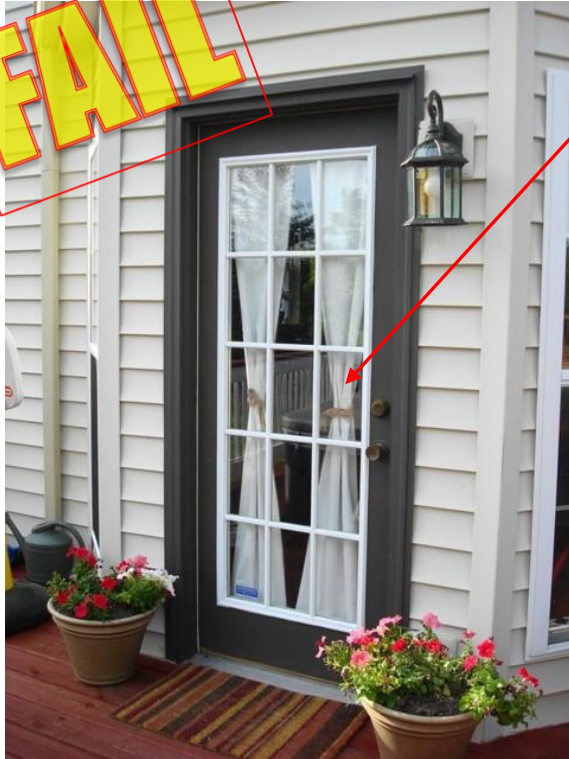
Figure 4: Failed exterior rear door example

Remember: There may not be any breakable glass within 40 inches of a deadbolt lock. This includes ALL exterior doors.