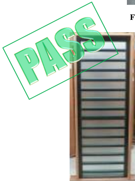
Figure D: Jalousie Window with metal grating