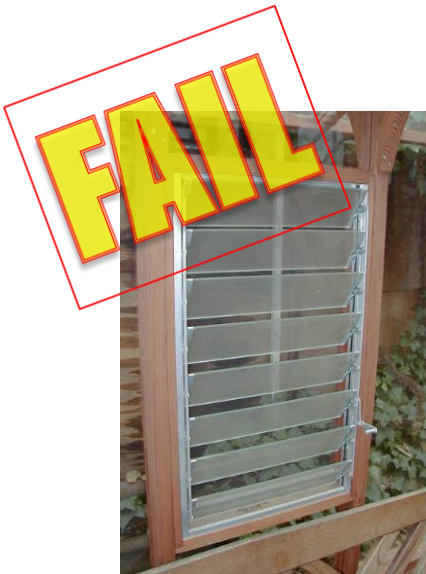
Figure C: Jalousie Window with plastic grating

Jalousie or louvered windows do not meet the specifications unless they have metal grating mounted.