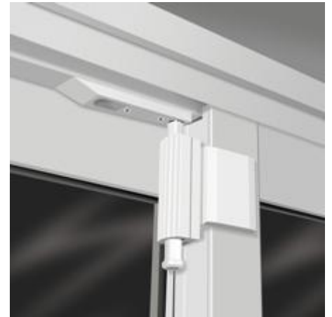
Figure 5: Auxiliary lock for a sliding glass door.