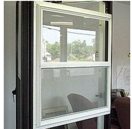
Figure 7: Storm Window

Please Note: Key-operated locks or other devices that require special tools or ability to open are prohibited by City of Arlington Fire Code.