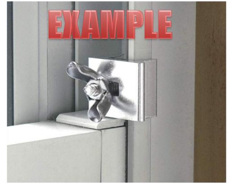
Figure 6: Auxiliary lock found in the door hardware section of most home improvement stores.