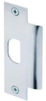
Figure 2: Steel Strike Plate